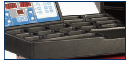
17-Pocket Weight Tray